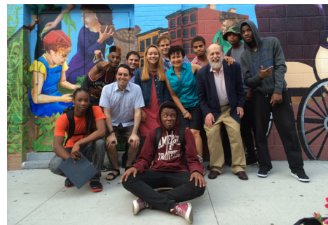
The Stargate Theatre Company members and staff

In the 2013-14 season, MTC continued in the second year of a pilot project: the Stargate Theatre Company, aims to support court-involved youth as they reintegrate into their communities. Summer 2014 saw nine court-involved male teenagers complete a six-week theatremaking, literacy and workforce readiness experience. As paid members of the Stargate company, these participants wrote, produced and performed an original piece of theatre for an audience of family, friends, case workers, teachers and mentors. The performance — held at City Center, Stage II — proved to be a deeply moving event highlighting the transformative power of theatre.