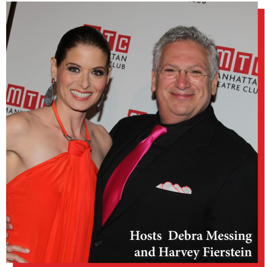
Hosts Debra Messing and Harvey Fierstein

The Spring Gala was enjoyed by more than 600 guests and raised over $1.6 million. We wish to thank our co-chairs, our sponsors, our donors, and the artists who contributed to the evening's success.