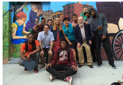
The Stargate Theatre Company members and staff

In the 2013-14 season, MTC continued in the second year of a pilot project: the Stargate Theatre Company, aims to support court-involved youth as they reintegrate into their communities. Summer 2014 saw nine court-involved male teenagers complete a six-week theatremaking, literacy and workforce readiness experience. As paid members of the Stargate company, these participants wrote, produced and performed an original piece of theatre for an audience of family, friends, case workers, teachers and mentors. The performance — held at City Center, Stage II — proved to be a deeply moving event highlighting the transformative power of theatre.