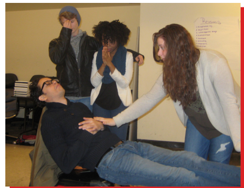
Family matinee attendees participate in a pre-show workshop