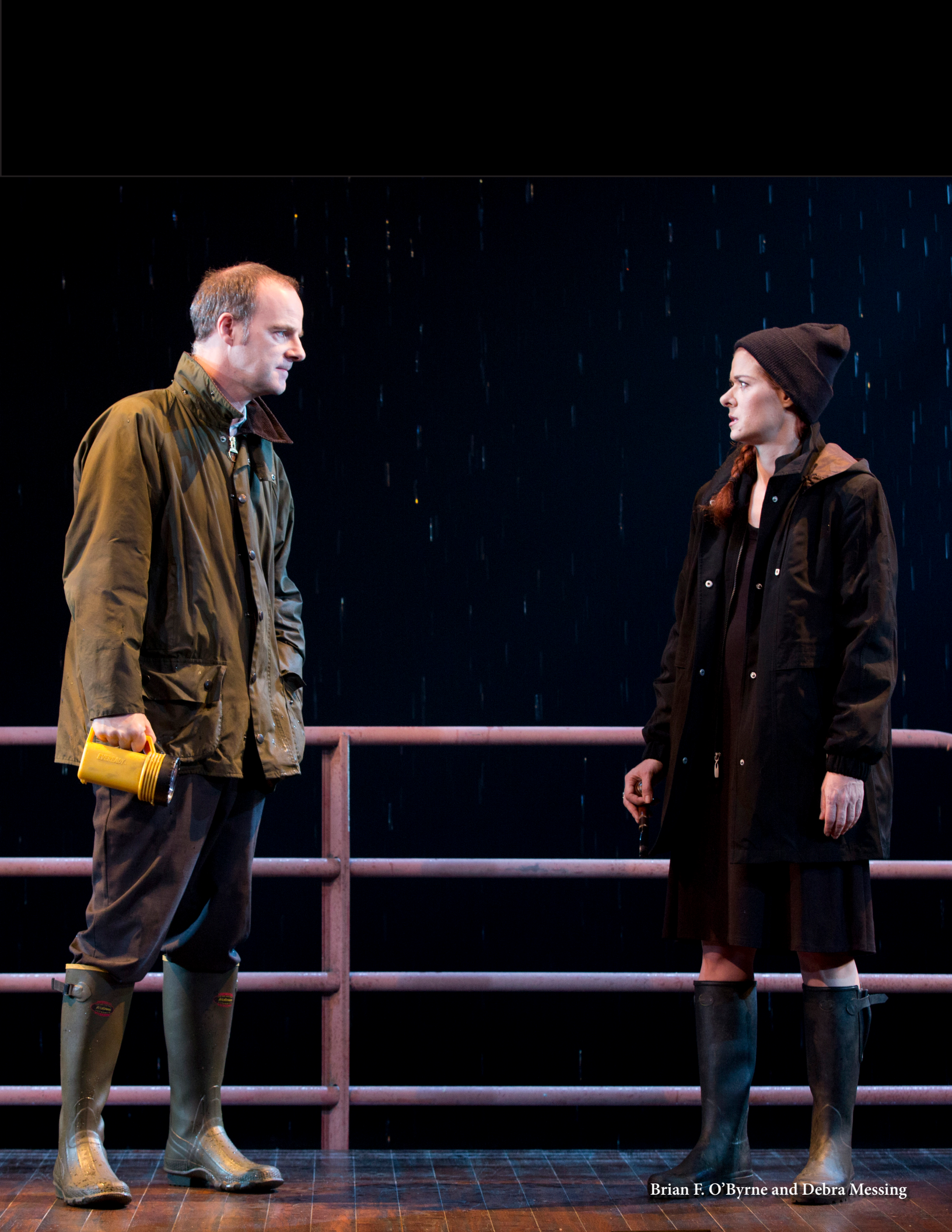
Brian F. O'Byrne and Debra Messing