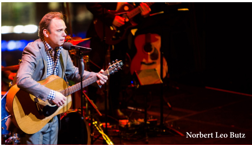
Norbert Leo Butz

The 2014 Winter Benefit raised $614,398 and all proceeds support MTC's mission. MTC is deeply grateful to the co-chairs, donors, and artists who made the event such a smashing success.