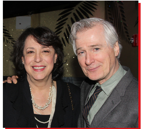
MTC Artistic Director Lynne Meadow and OUTSIDE MULLINGAR playwright John Patrick Shanley