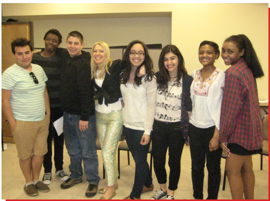
Spring 2014 Write Now! participants