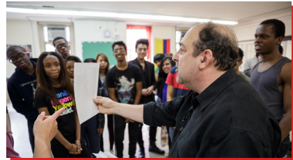
Students at Brooklyn Tech take part in a CASA VALENTINA CORE Unit workshop.

The Core Program , MTC's largest education initiative, integrates preparatory theatre-based classroom workshops with attendance at one of our productions. In the 2013-14 season, the Core Program served 1,729 students in 23 schools, exposing these students not only to the excitement of live theatre but also to a new kind of learning. For many of these students, it was their first time attending a professional production. The combination of precursory classroom study and theatregoing yielded compelling results. In the words of one Core student who attended a CASA VALENTINA education matinee, the experience "not only helped me further understand the plot, but also helped me discover things about myself and who I really, honestly am."