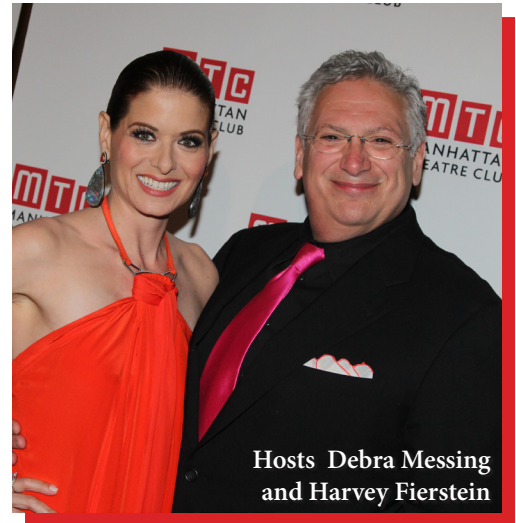
Hosts Debra Messing and Harvey Fierstein

The Spring Gala was enjoyed by more than 600 guests and raised over $1.6 million. We wish to thank our co-chairs, our sponsors, our donors, and the artists who contributed to the evening's success.