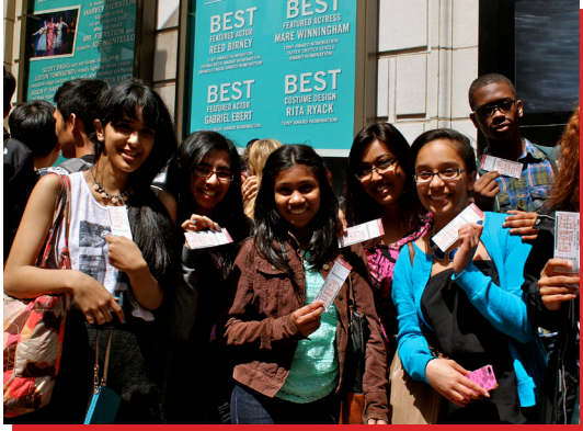
Brooklyn Tech students attend the CASA VALENTINA education matinee