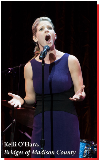
Kelli O'Hara, Bridges of Madison County